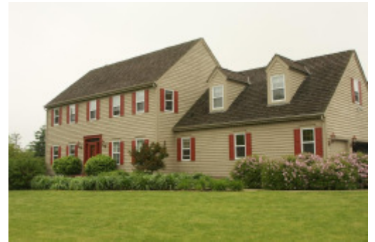
Our listing at W67 Oakwood Dr in Delafield, WI, MLS# 108-1827