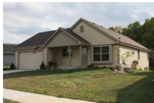
Our listing at 643 Yellowstone Dr. in Hartford, WI, MLS# 110-3352