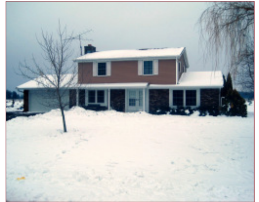
Our Listing at S94W35263 Crestfield Ct Eagle, WI

The New Team will continue to operate under the brokerage of Realty Executives Integrity which has dominated the marketplace for the past fifteen years! Realty Executives Integrity was built upon the foundational belief that the relationship between the Sales Executive and their Customer is what generates all successful Real Estate sales. Therefore, our Sales Executives have the freedom to personalize their service based upon the uniqueness of each specific property rather than trying to fit each home into a mass of other homes. The result equates to the utmost in attention to detail, customer service, and unmatched results!