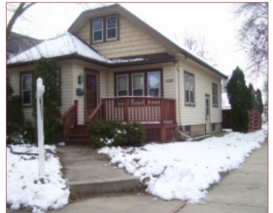
Our Listing at 2201 S. 77 th St West Allis, WI