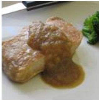
Saucy Apple Pork Chops