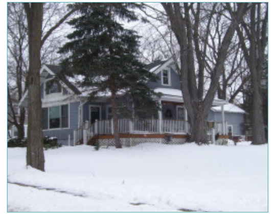
Our Listing at 1210 Lisbon Ave in Hartland $219,900

If you or anyone you know would like to take advantage of this incredible offer, we would be honored if you referred us to them. Have a great spring!!!