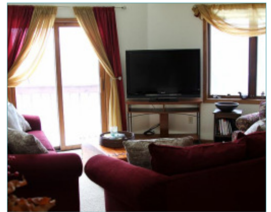
Our Condo Listing at 478 Manchester Ln in Hartland $164,900