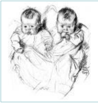
Love my Grandchildren